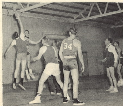
Ministers play basketball

"But there rose up certain of the sect of the Pharisees which believed, saying, That it was needful to circumcise them, and to command them to