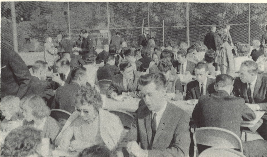
Midday feast during Conference